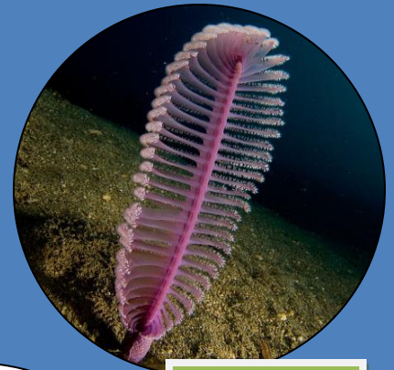
SEA PEN (Polyp)