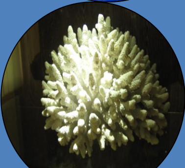
CORALS (Colonial polyps)